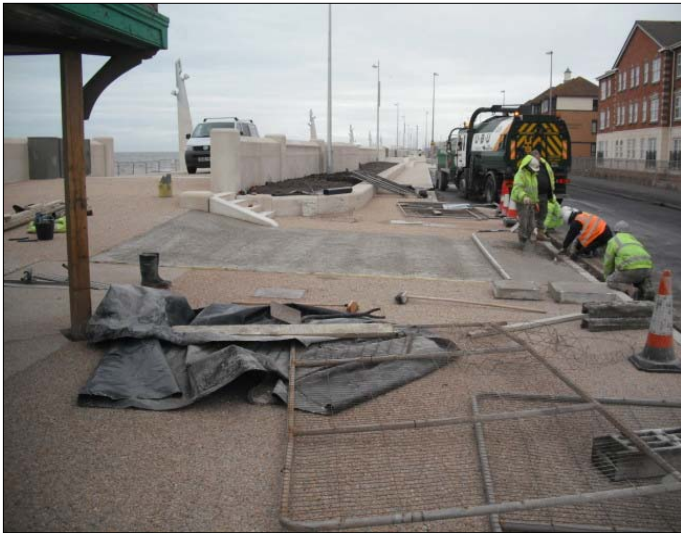
Last pavement slab concrete being placed.