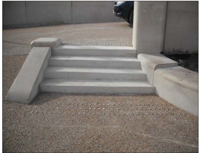
DDA studding in place at the top and bottom of the southern pedestrian access steps.