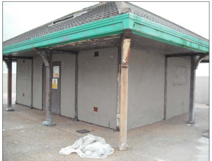
Rendering undercoat applied to United Utilities pumping station walls.

Further information about the scheme can be viewed at www.wyrecb.gov.uk www.cleveleys-seawall.co.uk