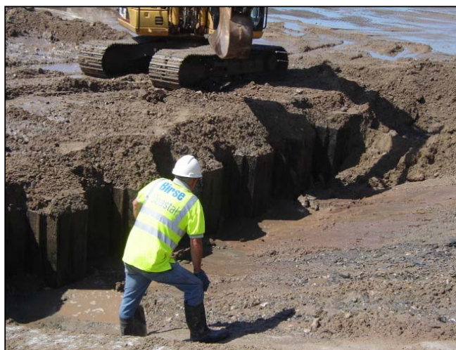
Bottom pour of panel 9 being prepared.