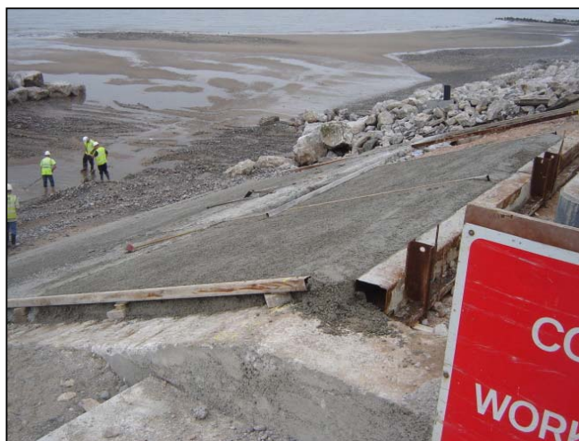
Construction of panel 10 being completed.