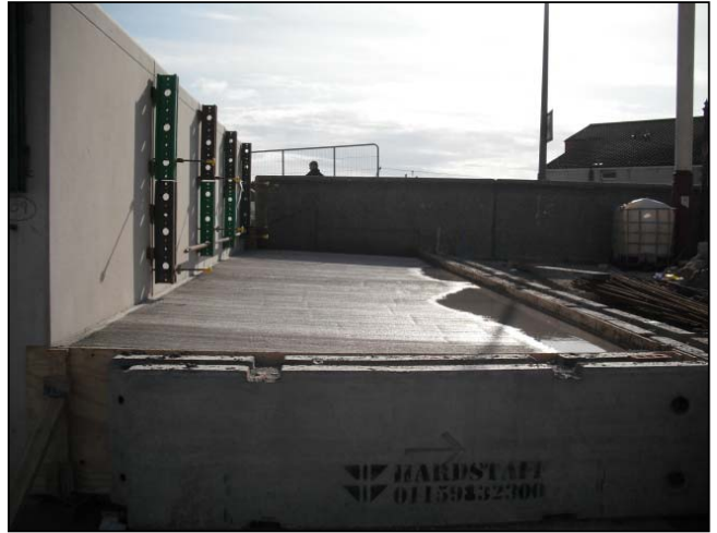
Concrete base completed with brushed surface finish.