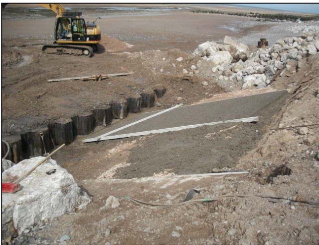
Bottom middle pour of panel 5 blinding being placed.