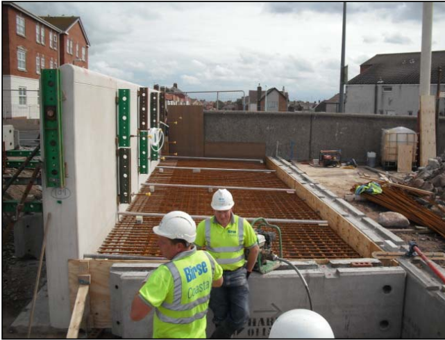
Wall base ready for concrete.