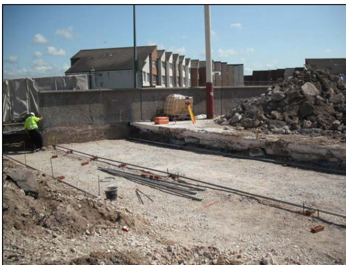
Excavation, stone and blinding complete to rear walls at the southern boundary.

Further information about the scheme can be viewed at www.wyrebc.gov.uk www.cleveleys-seawall.co.uk