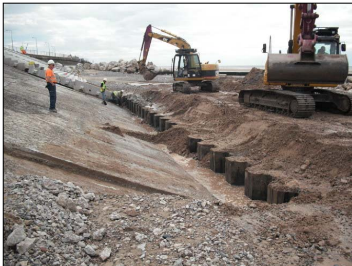
Bottom row of panel 8 adjacent to toe piles being prepared for revetment unit placing