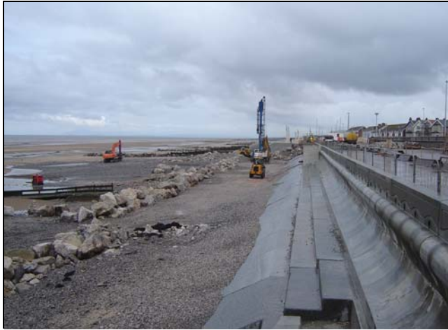
The piling rig placing the last of the stone columns.