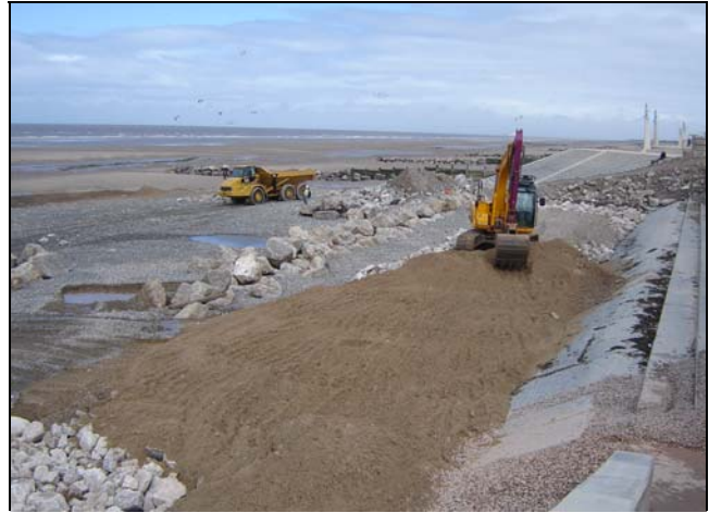
Final rip rap protection to the stone columns.