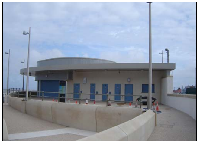
The New Wave building.

Further information about the scheme can be viewed at www.wyrebc.gov.uk www.cleveleys-seawall.co.uk