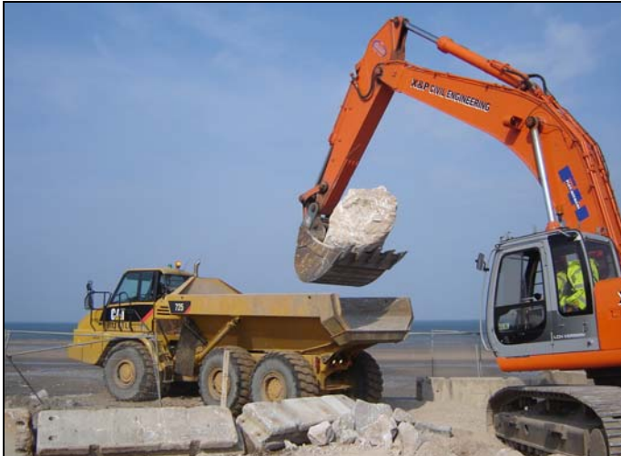
Loading rock armour prior to placement on the beach.