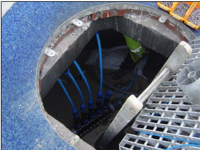
Installation of pipework within water feature.