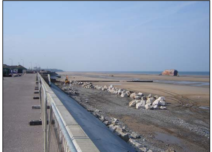
Rock armour in place on the beach.