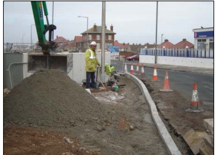
Construction of the roadside kerbing and pavement under construction