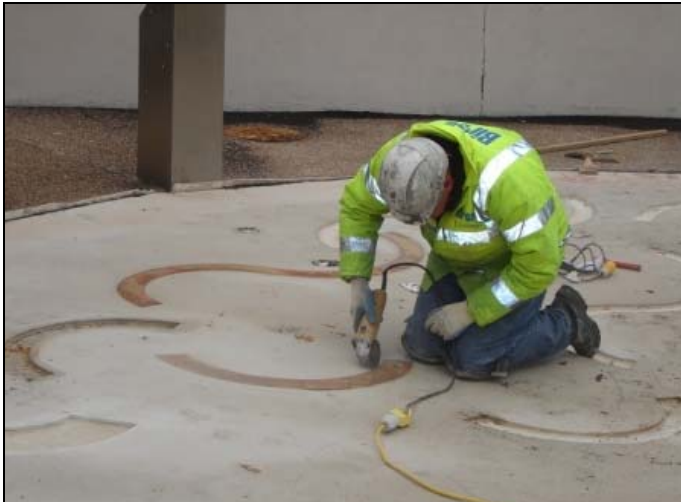
Preparation of the new water feature ahead of the application of the blue glass resin