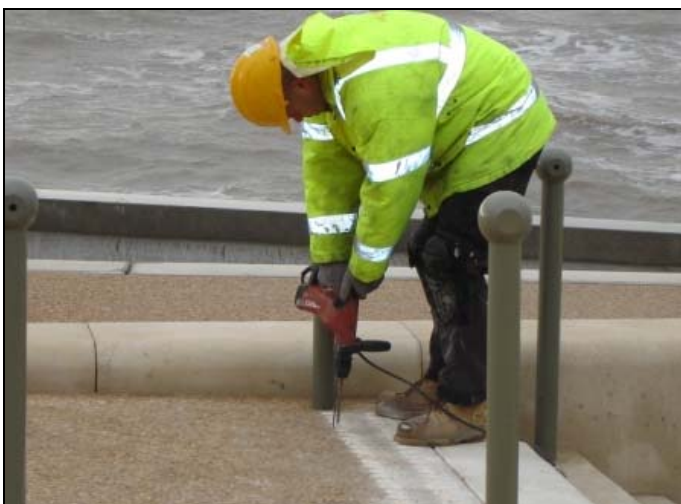
Installing stainless steel studs to indicate the top of a set of steps