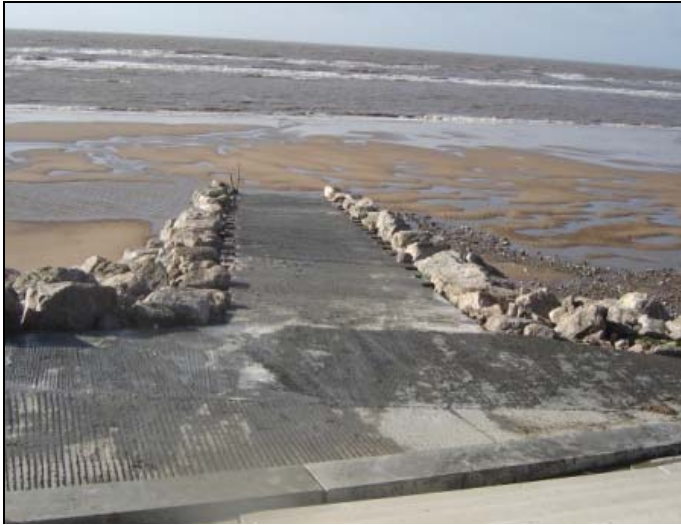
Completion of slade concrete surface