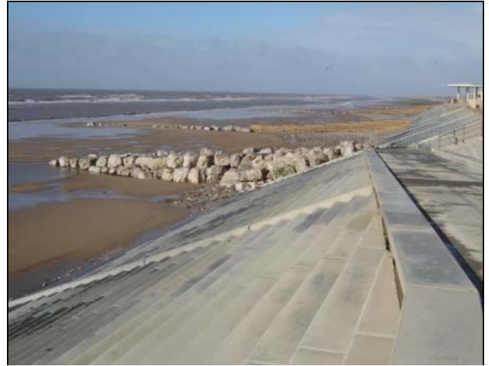
Installation of rock armour protection along slade extension