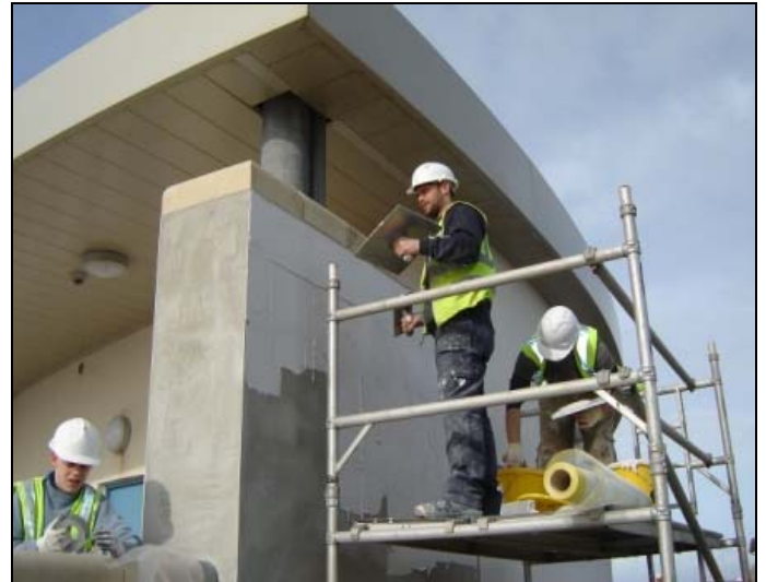
Rendering works to the promenade access wall