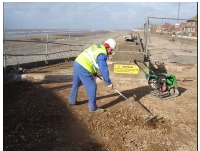
Grading of promenade sub-base prior to concreting works next week