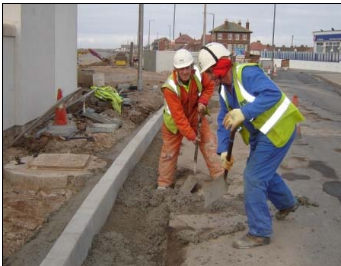
Installation of roadside kerbing adjacent to the café building