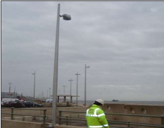
New lighting columns around the café building