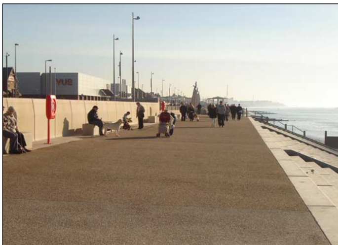
The promenade has been inundated with visitors due to good weather and the half term holidays.

The promenade is not yet finished and remains closed to the public until further notice. Wyre Borough Council and our partner Birse Coastal politely request that all members of the public Keep Out of the site for their own safety.