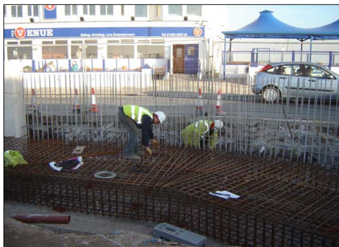
The tie-in wall reinforcement is fabricated.

Further information about the scheme can be viewed at www.wyrebc.gov.uk www.cleveleys-seawall.co.uk