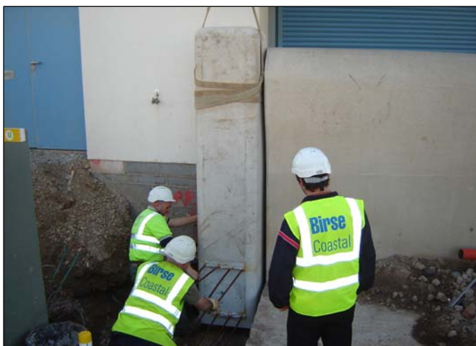
A pre-cast column is positioned at the cafe.