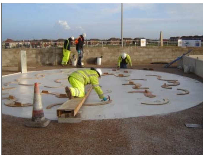
Templates for the blue resin enhancements are placed within the water play feature concrete pour