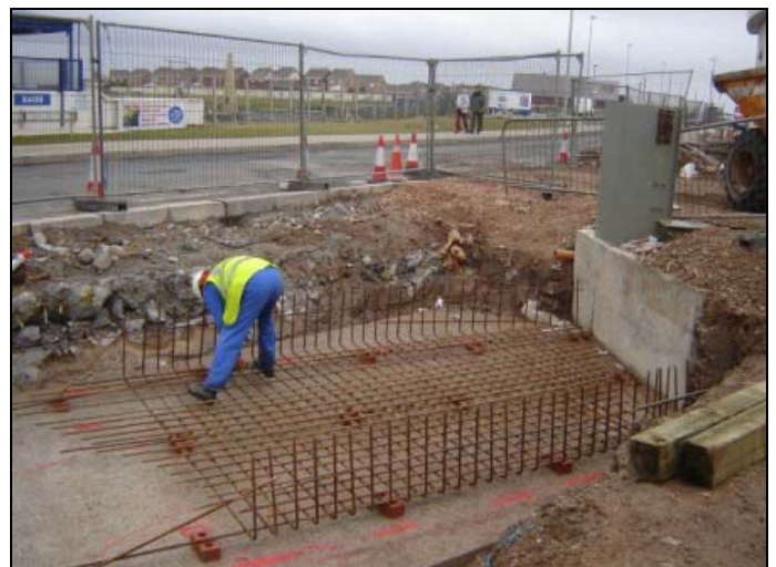
Steel reinforcement cages are fabricated for the tie in wall bases

Further information about the scheme can be viewed at www.wyrebc.gov.uk www.cleveleys-seawall.co.uk