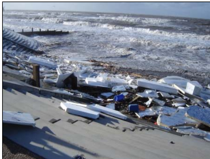
Just some of the debris from Riverdance which has been washed up within the site boundaries