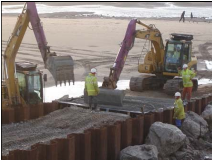
Toproc concrete is placed on the slade extension.