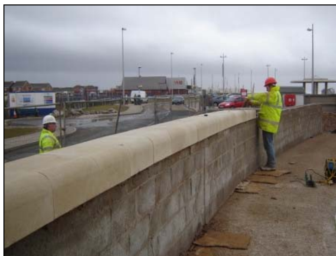
Pre-cast capping stones are placed by hand