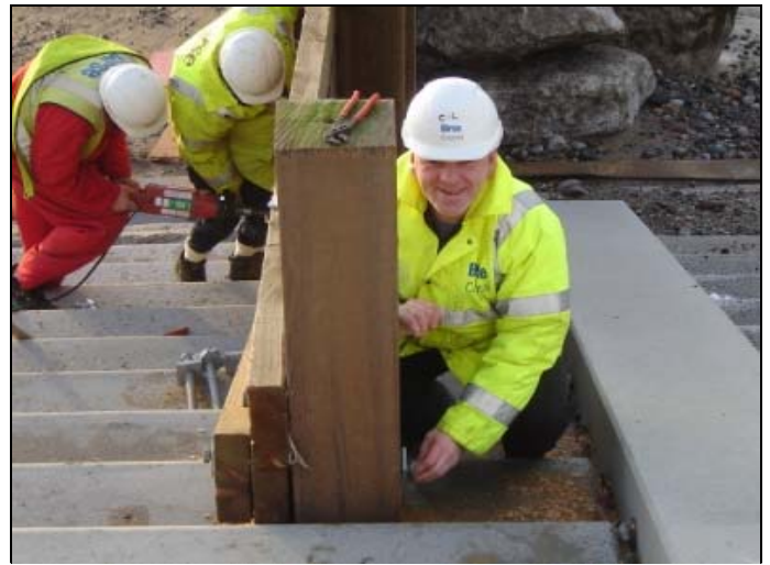
Additional bolts are fixed through the groyne boards