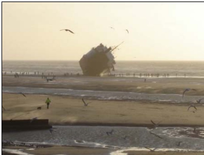
The listing Riverdance lies just to the south of the Cleveleys site

Coastguards are advising members of the public who plan to visit the site to view it from a safe distance on the promenade and not to venture down onto the beach.