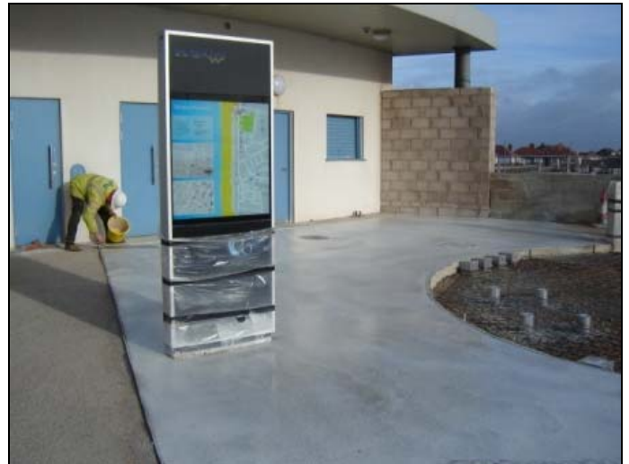
The final concrete slab has been poured in front of the café building