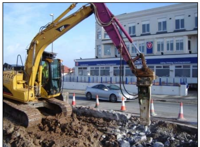
Demolition of the old promenade north of the site