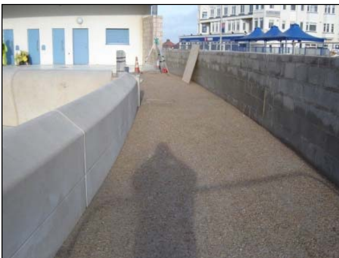
The café building access ramp is now completed