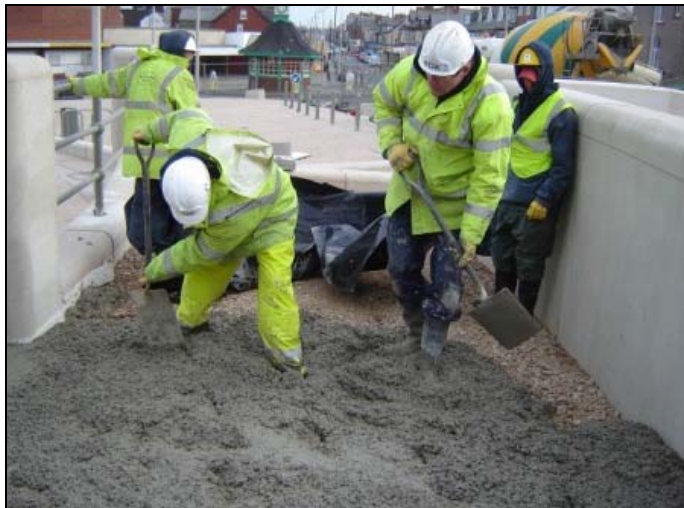
Completing the pedestrian access to the promenade from South Promenade