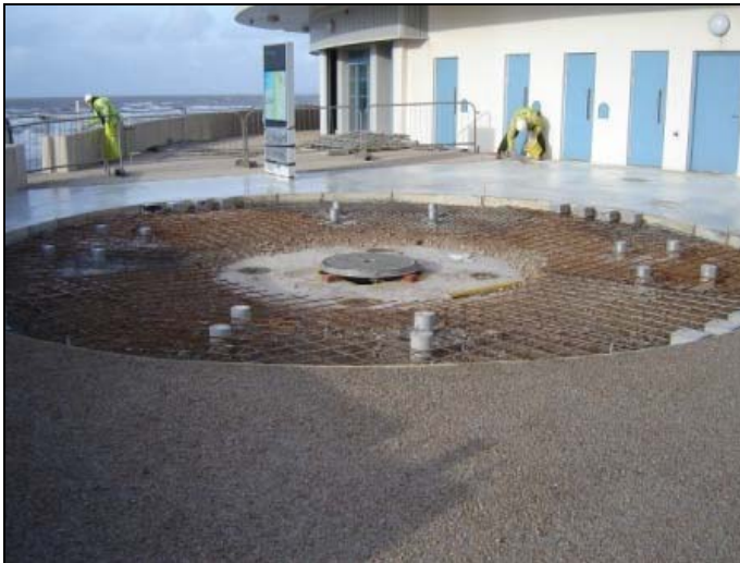
The interactive water feature