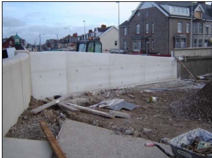
The tie-in wall between the new and old seawall