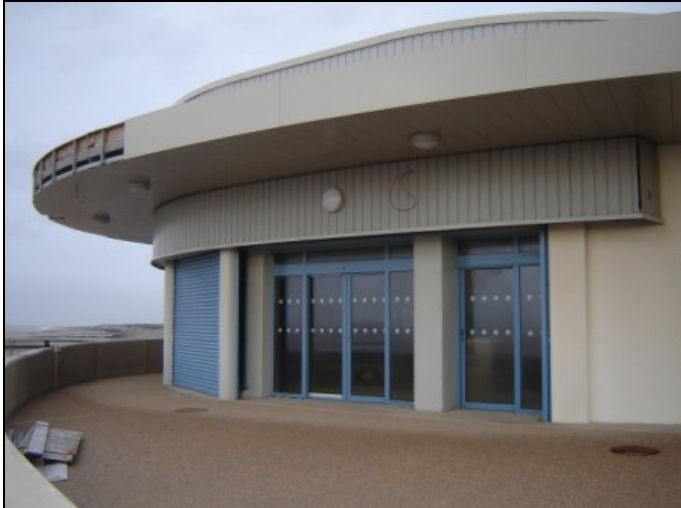
Final fitting of the roof fascia boards in progress