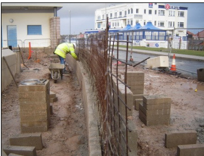
Construction of the roadside wall adjacent to the café area.