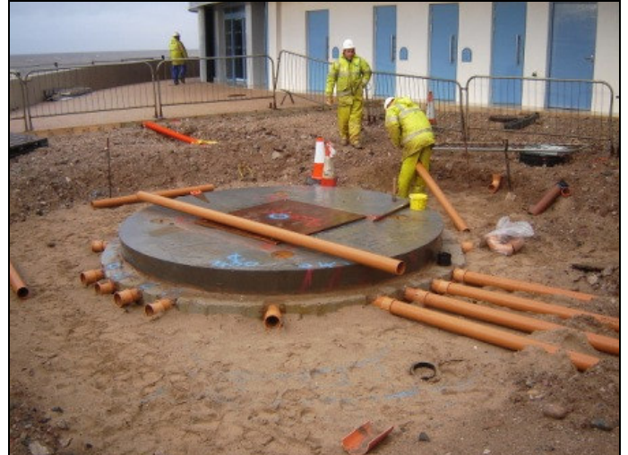
Installation of the water play feature