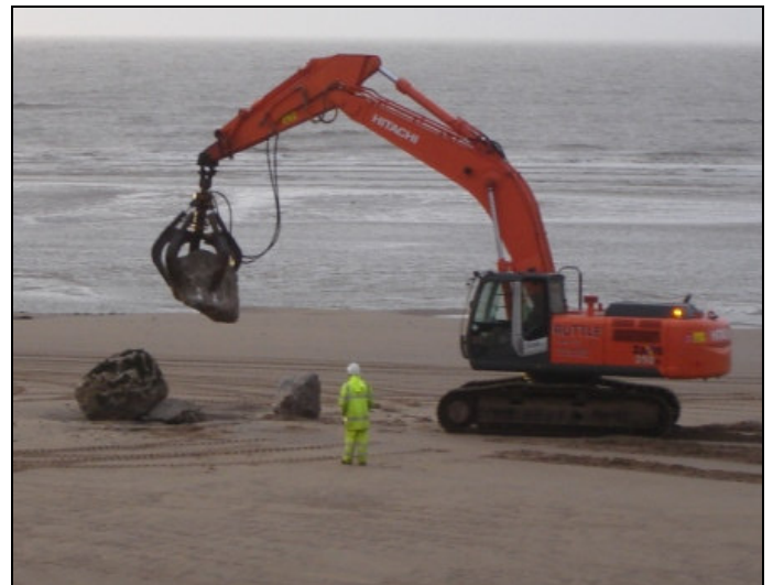
Moving rocks on the beach to form the groyne extensions