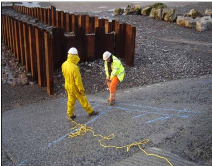
Coring for steel dowel bars to join the slade extension to the new slade