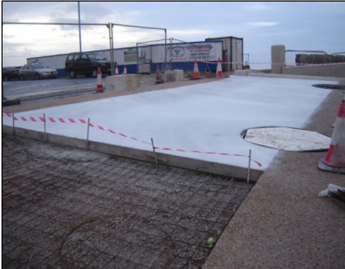
A freshly placed concrete panel prior to exposing the coloured aggregate