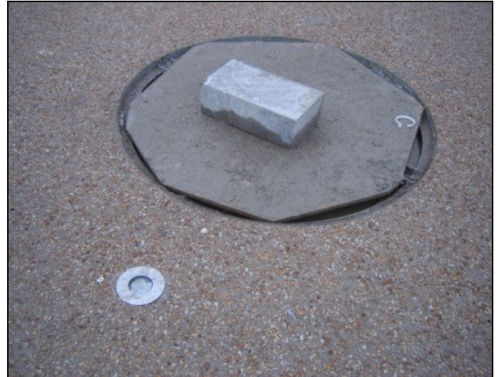
The finished surface, showing a circular planter and surface mounted light