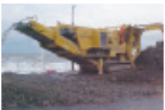
Recycling Demolition Material.

Large parts of the existing defences have been demolished. All material has been recycled; much of it has been crushed and incorporated within the new works.