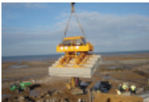
Unit being lifted into place.

In order to construct the defences it has been necessary to move large quantities of beach material. This material has been pushed out of the construction area but returns quickly. The completed sections of piling and bottom revetment have now been buried by the beach materials.