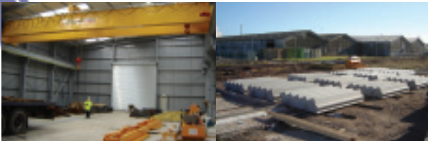
Facilities at Thornton

A variety of construction plant equipment can currently be seen on the beach. We have set up a pre-cast concrete facility at Thornton, which manufactures the 16 tonne concrete revetment units (steps).