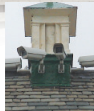
The Argus System

The existing children's amusement area at the end of Victoria Road West will be closed at the end of October 2006 to enable the next phase of construction works to commence. A site for a new children's amusement facility will be provided within the new scheme. Expressions of interest from potential operators will be sought very soon. It is anticipated that the new facility will be open for the 2008 season.